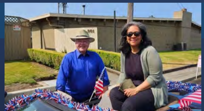
REP. STRICKLAND AT TUMWATER'S 4TH OF JULY CELEBRATION

"I RETIRED FROM THE D.O.D (ARMY) CIVIL SERVICE AT JBLM AFTER 34 YEARS. BUT MY RETIREMENT CHECK AND PART B MEDICARE WERE IN LIMBO FOR 10 MONTHS. I FINALLY CONTACTED MARILYN STRICKLAND'S OFFICE FOR HELP. WITHIN TWO WEEKS, I RECEIVED A LUMP SUM PAYMENT FOR THE 10 MONTHS OF NON-PAY, A LETTER DETAILING THAT MY RETIREMENT HAD BEEN FINALIZED, AND CONFIRMATION THAT MY MEDICARE WAS APPROVED."