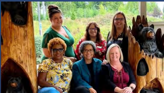
REP. STRICKLAND W/ WSA HEAD START & ECEAP

"I HAD BEEN WORKING WITH CLAIMS AND APPEALS WITH THE VETERAN AGENCY FOR OVER A YEAR. I REQUESTED REPRESENTATIVE STRICKLAND TO STEP IN ON MY BEHALF. IT TOOK LESS THAN ONE WEEK TO GET RESULTS. SHE IS A FRIEND TO VETERANS!"