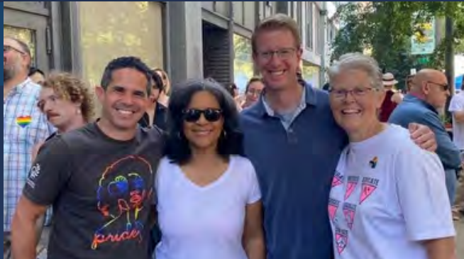
REP. STRICKLAND AT THE TACOMA PRIDE FESTIVAL