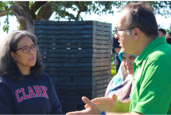
Strickland listening to small farmers' needs