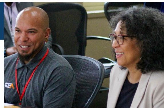
Strickland advancing small businesses and jobs in the district

"Through Congresswoman Marilyn Strickland and her staff, our 75-year-old family business was able to navigate through the "firewalls" of the Small Business Administration..."